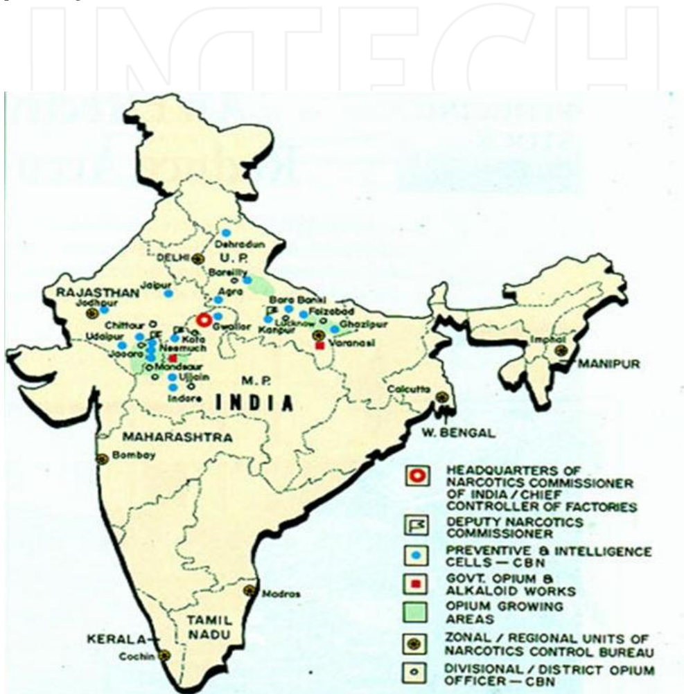
Figure 2. Opium cultivating areas in India and different offices of Narcotics Deptt.

Narcotics with its headquarter at Vienna, Austria. But at some places illegal cultivation is also being practiced which include Golden Crescent (Iran, Afghanistan and Pakistan) and Golden Triangle (Thailand, Burma, Myanmar). In Afghanistan, illegal cultivation of opium poppy to a large extent is the reason for very high drug trafficking compared with other illegal cultivating areas. Eleven other countries i.e. Australia, Austria, France, China, Hungary, the Netherlands, Poland, Slovenia, Spain, Turkey and Czech Republic also cultivate opium poppy, but they do not extract gum. They cut the bulb with 8" of the stalk (CPS system) for processing to extract alkaloids (Described earlier).